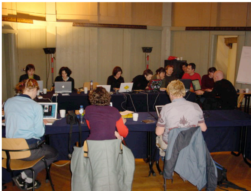
KeyWorx workshop at Waag Society.

Sher: There's no graphic interface. The initial interface that I designed was very quirky, and I still am quite fond of it, but the code quickly outgrew that design. As we kept adding